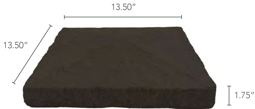
PEAKED PILLAR CAP